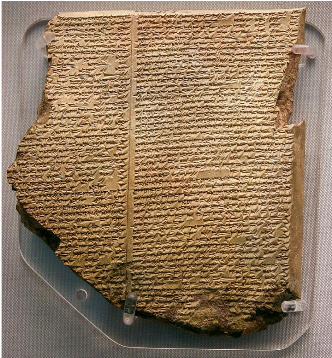
The Flood Tablet, 11th cuneiform tablet in a series relating the Gilgamesh epic, from Nineveh, 7th century BCE